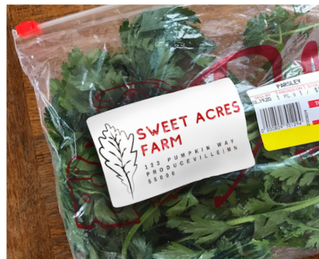
These three images show the correct labeling for packaged produce items sold by Qualified Exempt farms.